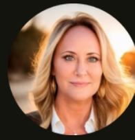
Louise Miller Results Plus